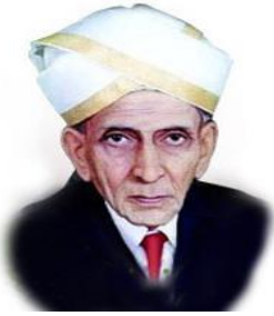
Bharat Ratna Sir M. Visvesvaraya